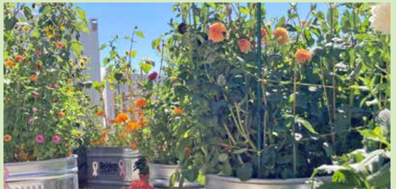
Flowers donated by the Cancer Victory Garden